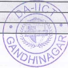
Executive Registrar DA-IICT, Gandhinagar