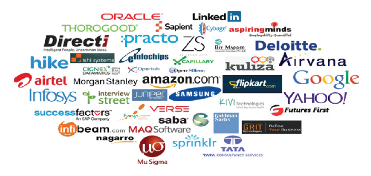
Pool of Visited Companies at DA-IICT